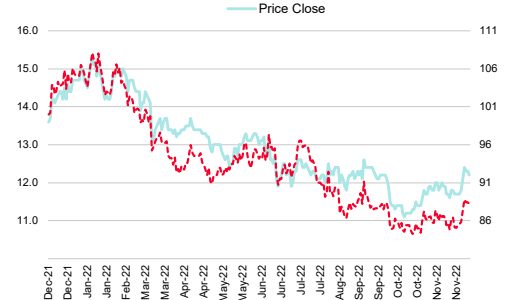
Sino Thai Engineering & Construction Plc (STEC TB)